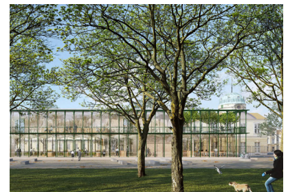
Charlottenburg Palace - Visitor Center in Berlin