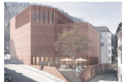
Documentation and Cultural Center of German Sinti and Roma in Heidelberg