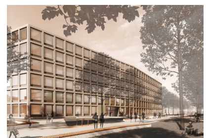
Laboratory Building of the Beuth Technical University in Berlin