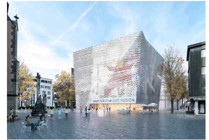
House for Film and Media in Stuttgart