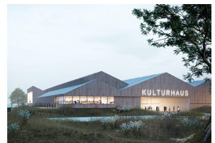
Cultural Center in Schleswig